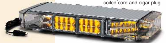
Magnetic Mount with coiled cord and cigar plug

The use of any magnetic or magnetic/suction mounted warning beacon on the outside of a moving vehicle is not recommended and is at the sole risk of the user.