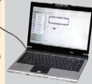
Electronic Control Module

Laptop or PC is used to configure control of the lightbar