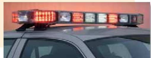
When lighted, comes alive with ultra bright warning impact