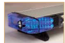
FW Extended Corner Light