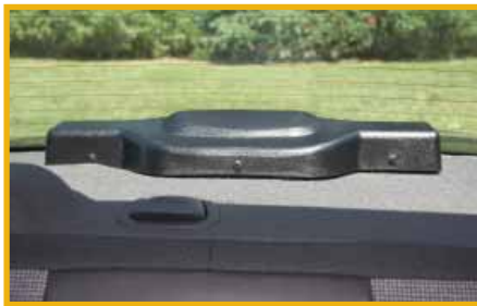
Same mount shown from inside the vehicle.

Whelen Engineering reserves the right to upgrade and improve products without notice.