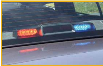
TLNCV5RB shown bracket mounted around 3rd brake light in rear deck.

This low profile, lightweight warning light packs full-size Linear Super-LED power that rivals strobe in intensity! Now you can have serious warning protection without altering brake light visibility in a package that's easy to mount or transfer from vehicle to vehicle.